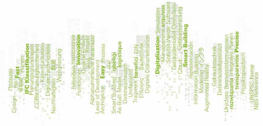
Fig. 6. Create the perfect Schüco solutions through teamwork