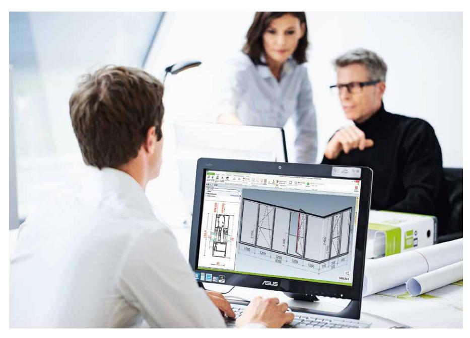
Fig. 1. Metal fabricators use Schüco hardware and software applications to design their actual metal fabrication units

These days, whenever we visit our customers and partners, we are increasingly asked, "What do we actually have to do to be involved in these BIM projects?" It's a simple question, but there is no simple, general answer – all the more so because we are an international business and there are very different framework conditions in each country. BIM structures are significantly further developed in the UK, Scandinavia, the Baltic States and Benelux than here in Germany, for example. The answer to this question therefore needs to focus on different aspects in each case.