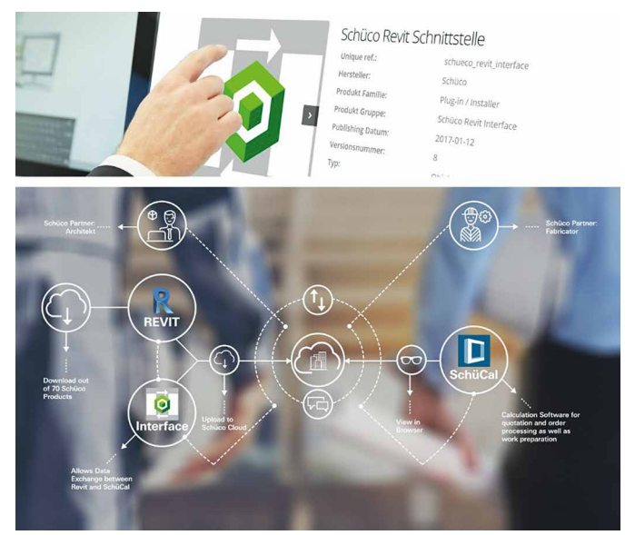
Fig. 3. The interface can be used to import specific building components into BIM models

After installing the Schüco Revit interface as a plug-in in Revit, specifiers can save information about wall-based opening units (windows, doors, sliding systems, façades etc.) as an r2s file via a brief dialog box and then send it on. (Fig. 3)