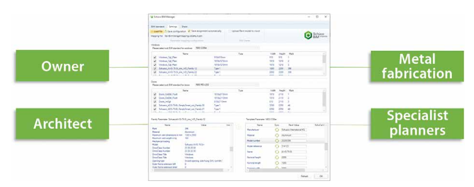
Fig. 5. With the Schüco BIM Manager, unique building component information can be entered and managed in a standardised way