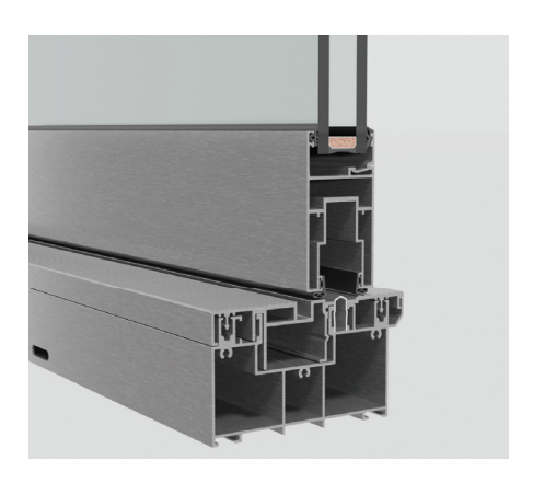
Bottom detail_zero-level threshold