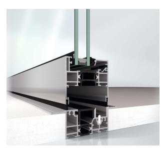
Complete flush threshold