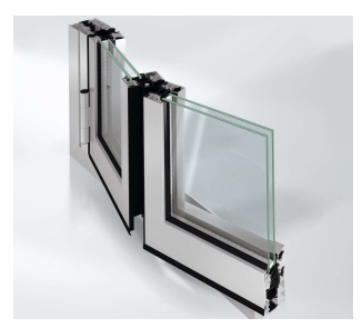
General system section