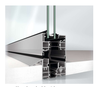
Flat threshold with easy access