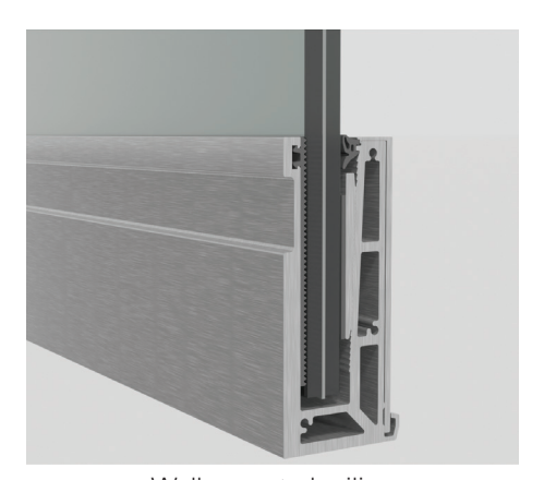
Wall mounted railing