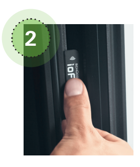
Insert IoF ID into unit