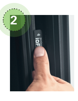
Insert IoF ID into the unit

All units, data and documents are transferred from SchüCal, integrated and listed