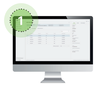
Create a building in the IoF Manager