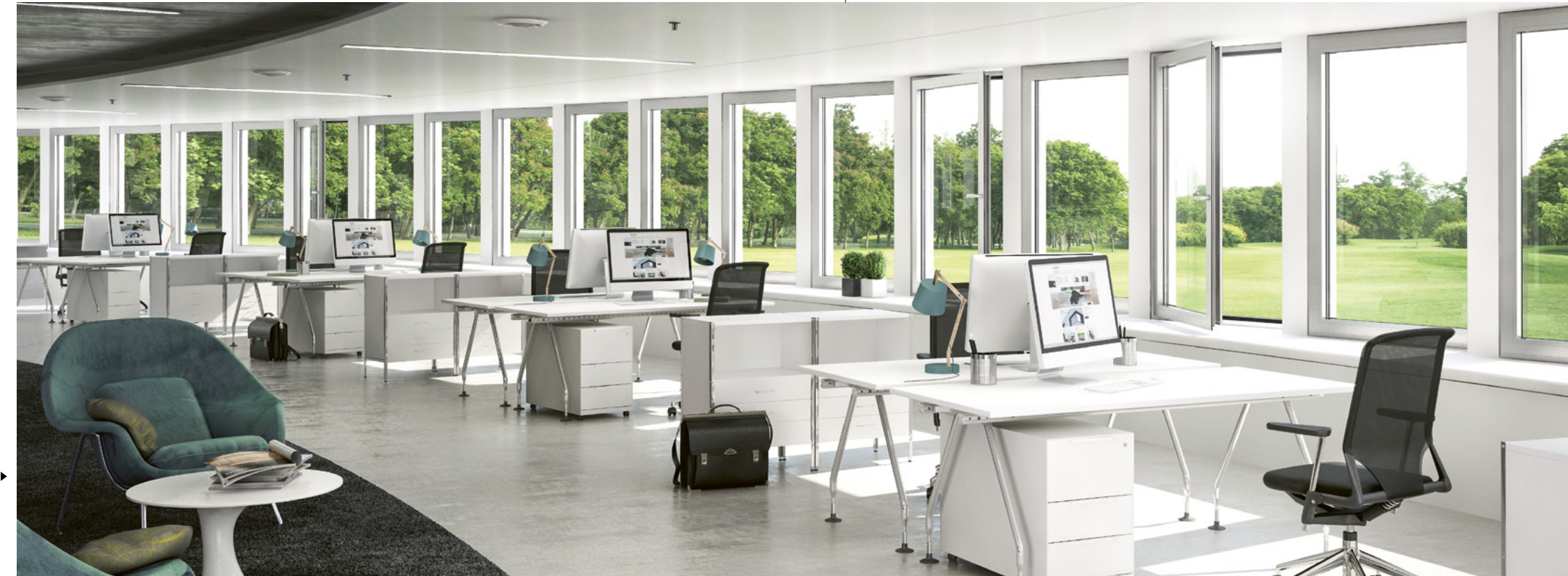
With C2C Silver certification: ► Schüco AWS 75.SI+ window

A closed cycle of this kind must prove that all materials used are free of pollutants and that they are produced using renewable energy so that they are safe and do not harm people or the environment.